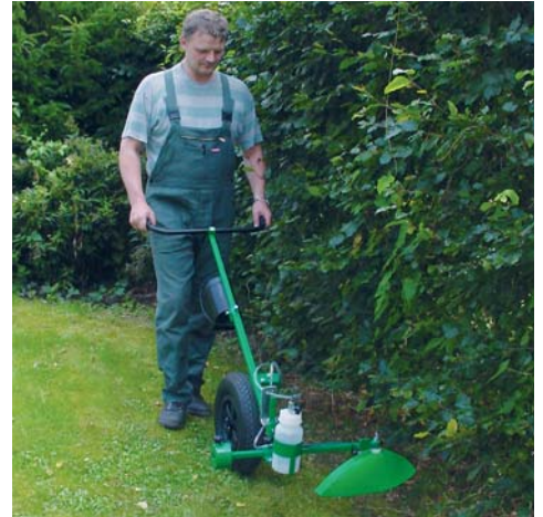
Model: MANKAR-L (spray cover left; optionally on right)