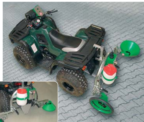
Model: VARIMANT-2 with quad